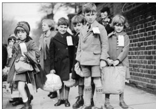
A CHILD'S WAR