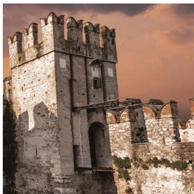
Towers, Tunnels and Turrets