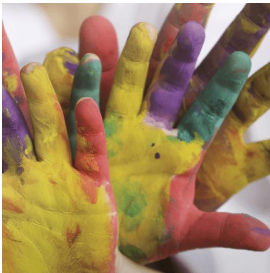
Muck, Mess and Mixtures

We are looking forward to welcoming your children into their new year group and into their new classes! These are the exciting topics we will be covering throughout the year: